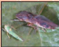
Glassy Winged Sharpshooter